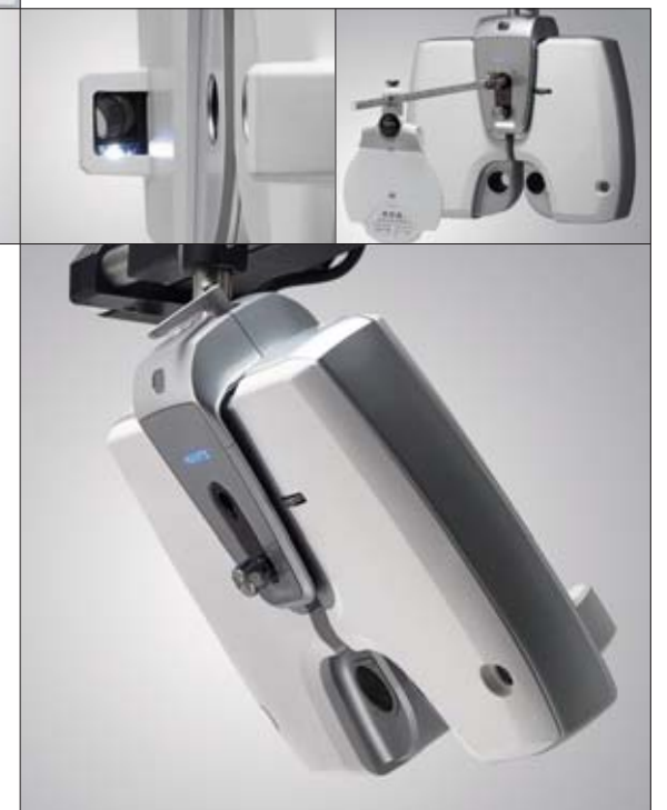
Tiltable Refractor Body

Slimmer design even prevents minimum mechanical interference during exam and enables easy monitoring over patients.